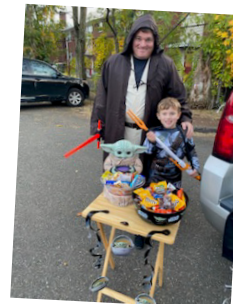
Trick or Trunk