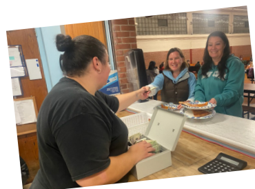
Movie Night Volunteer

The Scholarship which provides 2 awards of $550 each, Is designed to reflect the values of the Knights of Columbus, Charity, Unity, Fraternity and Patriotis.