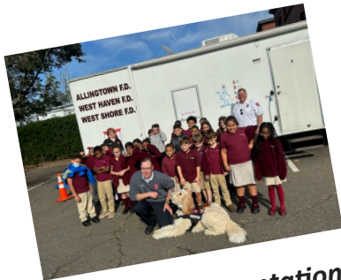
Fire Dept Presentation