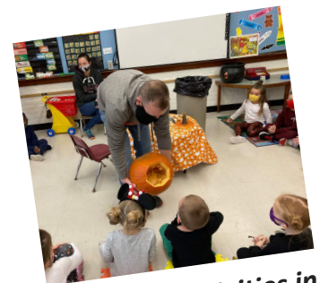
Seasonal Activities in the Classroom