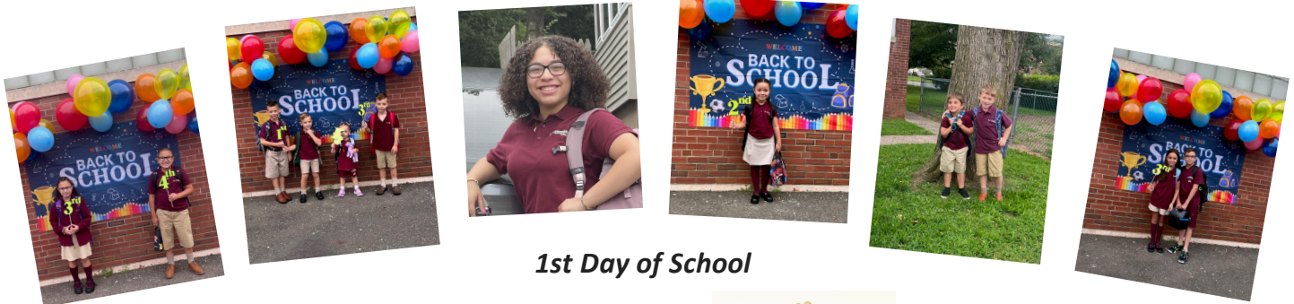
1st Day of School